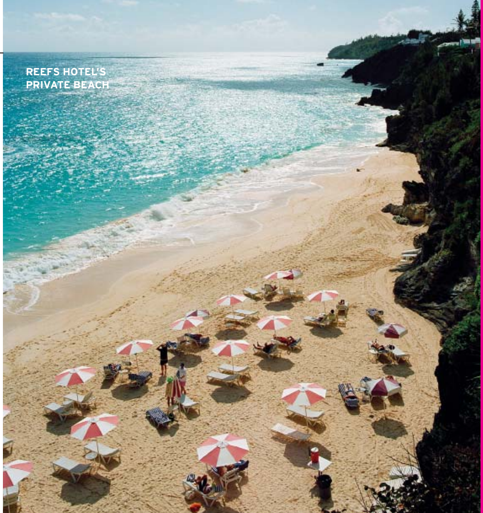
REEFS HOTEL'S PRIVATE BEACH