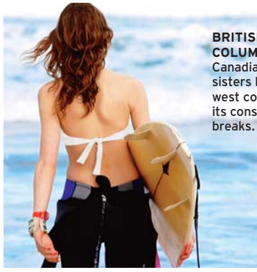
BRITISH COLUMBIA Canadian surf sisters love the west coast for its consistent

MANITOU BEACH, LITTLE MANITOU LAKE The prairies' answer to the Dead Sea, this resort village draws people looking for a relaxing spa getaway at a unique site. Bathers "take the waters," absorbing the therapeutic minerals (magnesium, carbonate, potassium, mineral salts, sodium, calcium, iron, silica and sulphur) concentrated in this shallow saltwater lake. The water is too dense for any real swimming-there's five times as much salt here as there is in the ocean - but the floating is fun and it's virtually impossible to sink. The Manitou Springs Resort and Mineral Spa is the spot to check in. manitousprings.ca. Wow Factor: Experience weightlessness without having to sign up for a NASA shuttle. Where It's At: From Highway 2 at Watrous, drive north on 365. manitoubeach.ca.