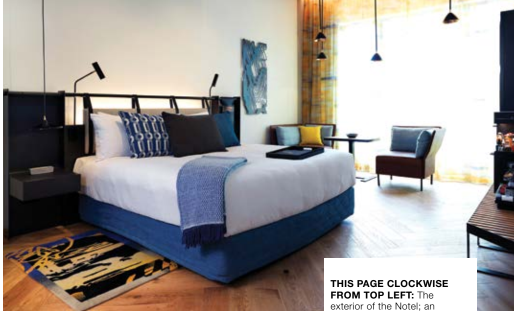
THIS PAGE CLOCKWISE FROM TOP LEFT: The exterior of the Notel; an executive king room at the QT hotel; the artistic bathroom at the Adelphi Hotel.