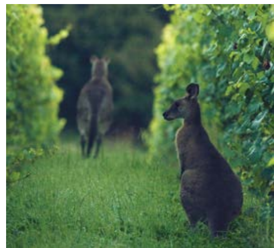
CLOCKWISE FROM TOP LEFT: The Block Arcade; graffiti in the laneways; the National Gallery of Victoria; frolicking kangaroos in Yarra Valley; hot air ballooning over the Yarra Valley Vineyards.

Get lost in the three square blocks of shopping malls clustered around the Bourke Street Mall at Bourke and Elizabeth streets. Mega retailers sit side-by-side with the beautifully preserved Block Arcade and Royal Arcade, which exude Victorian glamour.