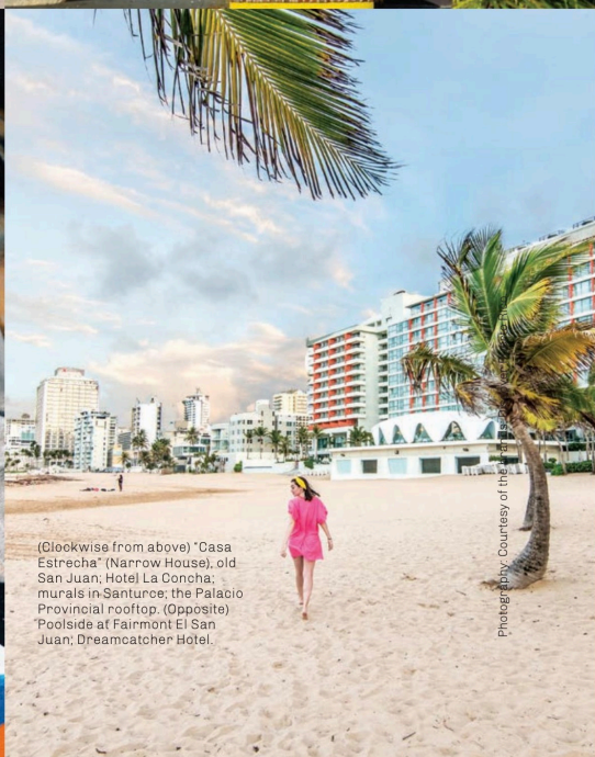
(Clockwise from above) "Casa Estrecha" (Narrow House), old San Juan; Hotel La Concha; murals in Santurce; the Palacio Provincial rooftop. (Opposite) Poolside at Fairmont El San Juan; Dreamcatcher Hotel.