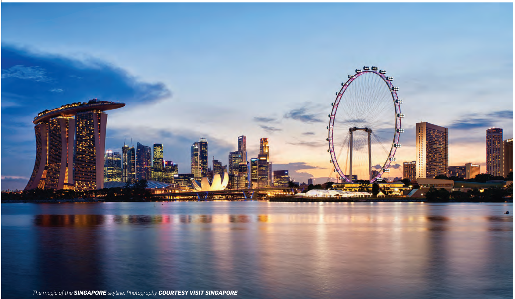
The magic of the SINGAPORE skyline.