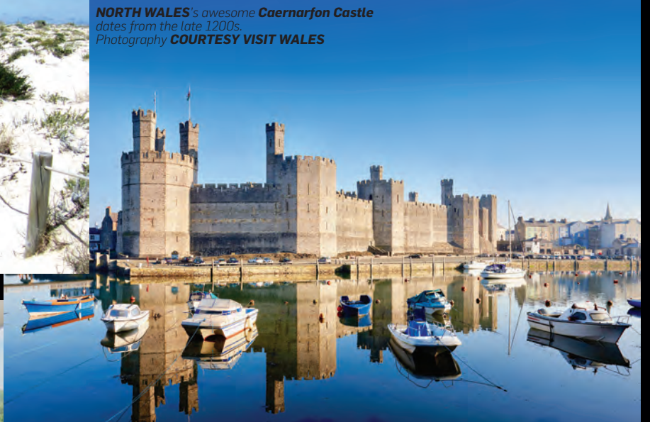
NORTH WALES's awesome Caernarfon Castle dates from the late 1200s.