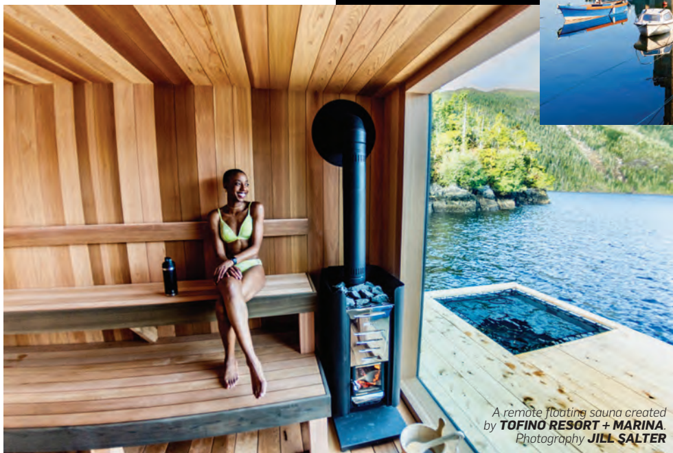
A remote floating sauna created by TOFINO RESORT + MARINA .