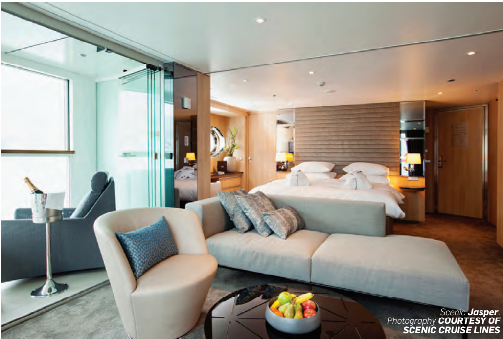
Scenic Jasper Photography COURTESY OF SCENIC CRUISE LINES