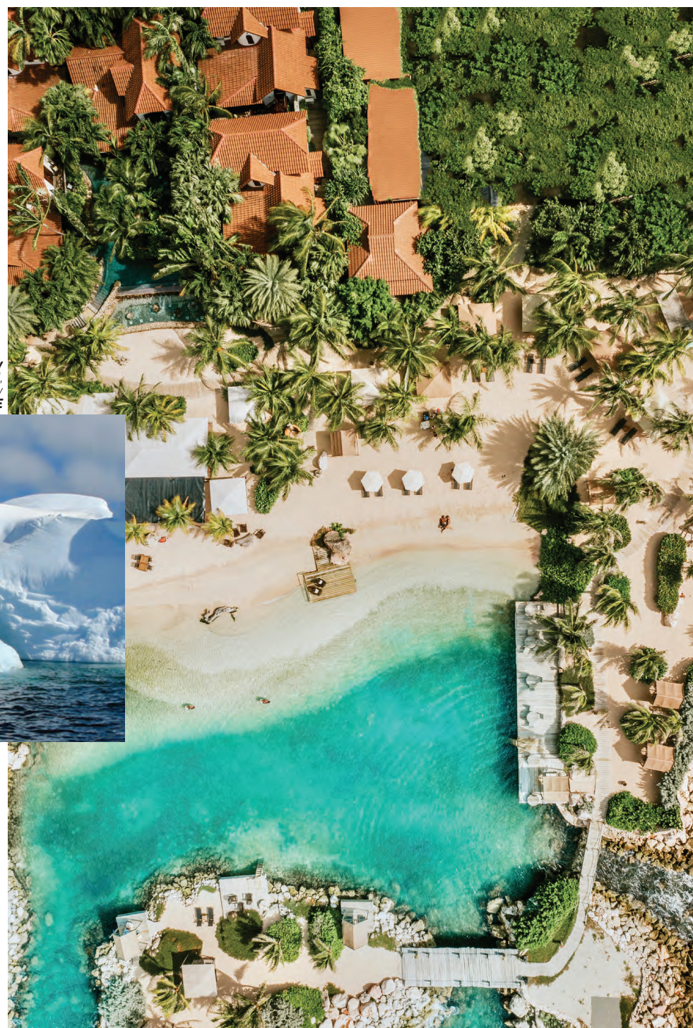
The 23-room Baoase Luxury Resort in Steenrijk, Willemstad, CURAÇAO .

ST-BARTHS.COM LEBARTHELEMYHOTEL.COM HOTELSBARRIERE.COM