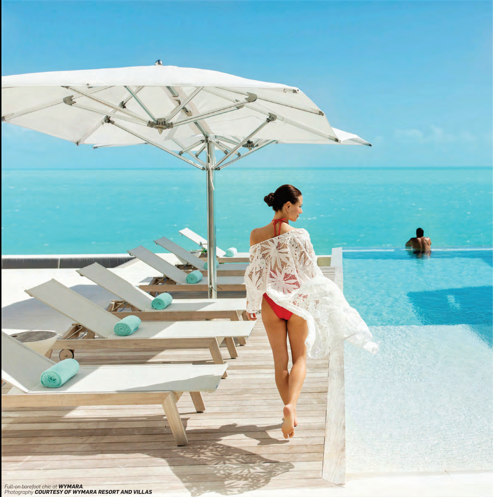
Full-on barefoot chic at WYMARA .