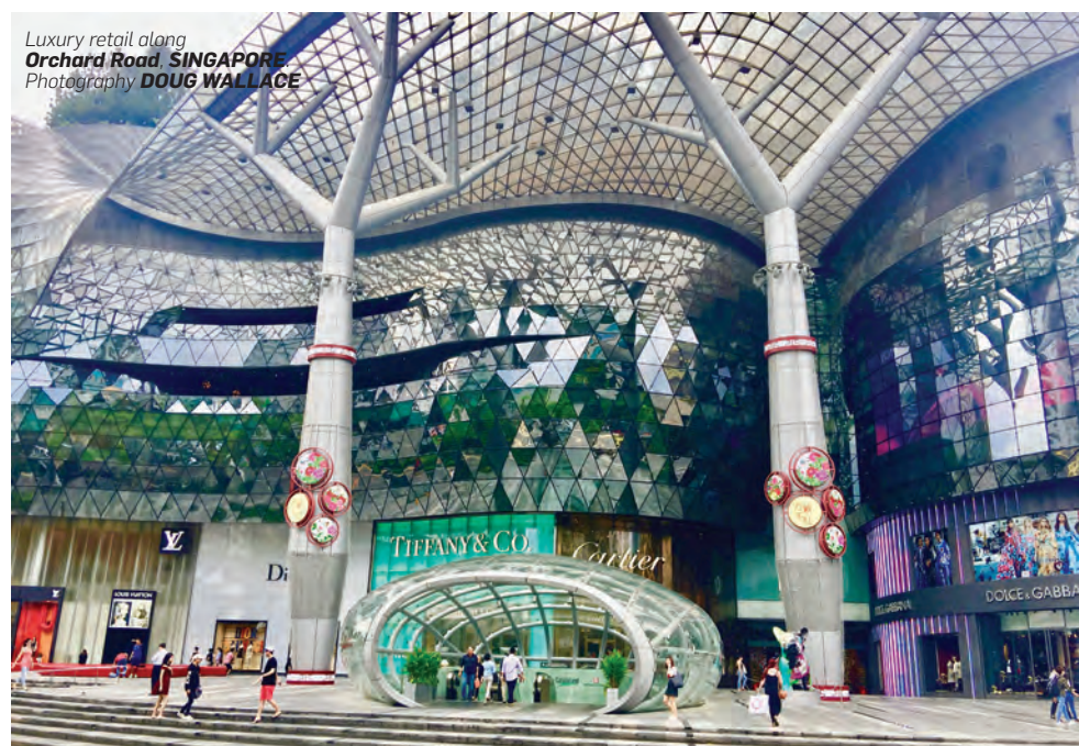
Luxury retail along Orchard Road, SINGAPORE . Photography DOUG WALLACE