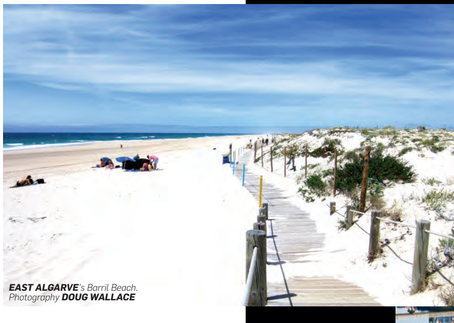
EAST ALGARVE's Barril Beach.